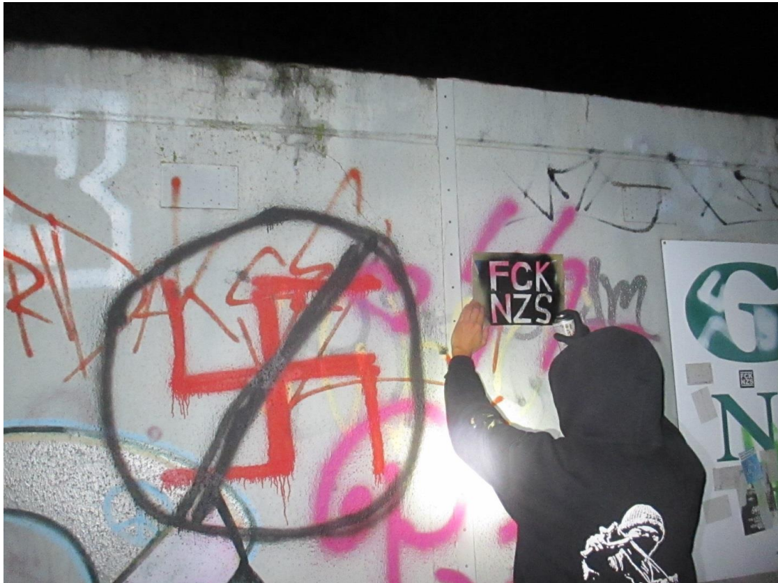
Plate 3: Graffiti against Nazis (permission to use this photo was granted by the photographer, a member of the activist group)

Other anti-fascist and anti-racist actions at the local level include not just (over)painting and spraying of graffiti, removal and application of stickers, support and cooperation in local 'associations against the right', the observation of xenophobic developments at schools and the contacting of fan groups in the football stadium, but also organising autonomist structures to help refugees and holding benefit- or solidarity events for (e.g. the Kurdish) freedom fighters abroad. At the same time, youth work is carried out in the local neighbourhood: