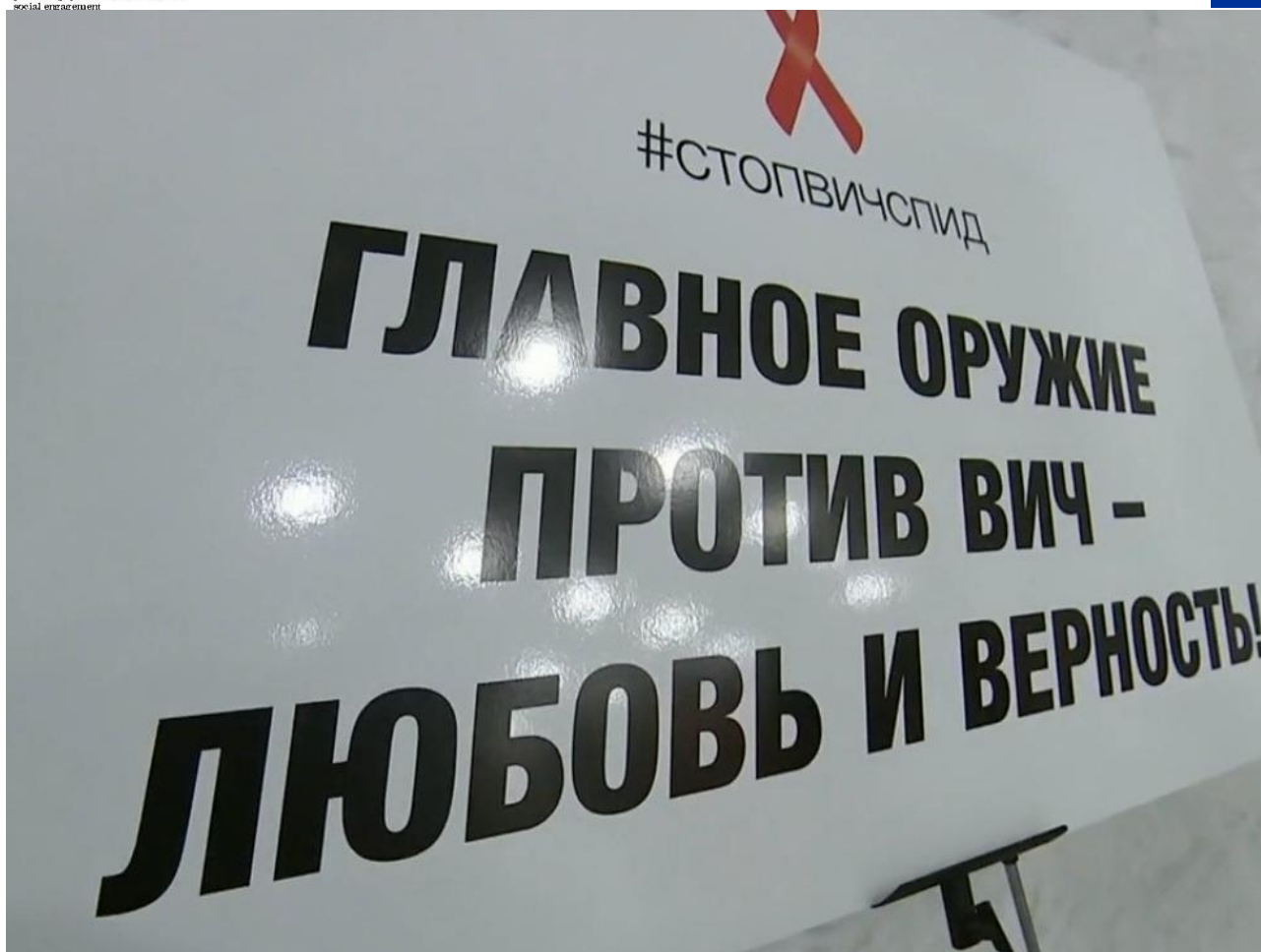
Plate 1. One of the slogans of the ‘Stop HIV/AIDS’ campaigns held by the Foundation for Social and Cultural Initiatives under the supervision of S. Medvedeva in 2017.

Another important structural condition that determines the context of life of HIV-positive people is legislation. The law on the prevention of the spread of HIV infection was adopted in 1995, and many activists believe it to be outdated and to infringe people's rights, despite the amendments. This is primarily due to the restriction of professional activities, restriction of entry into the country for HIV-positive foreign citizens and their deportation if they do not have any close relatives.