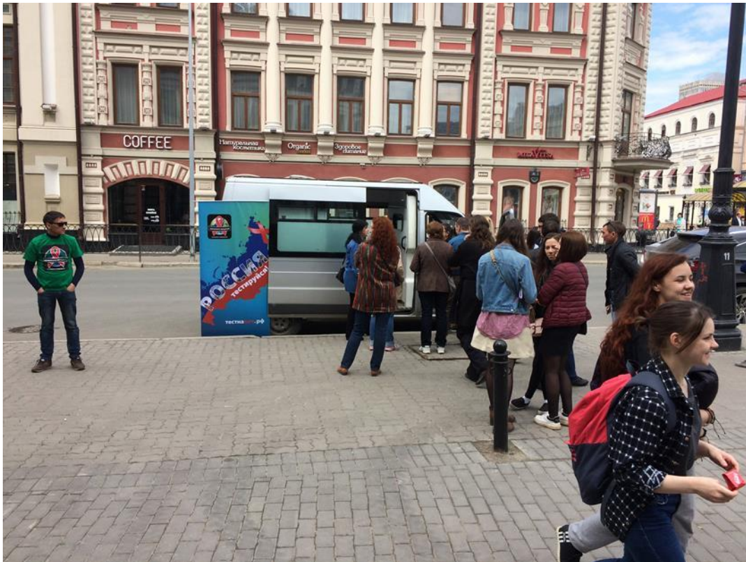
Plate 2. Campaign for HIV testing and distribution of leaflets and condoms.

A special area of activity of HIV activists is educational work with young people in vocational schools and universities (see Plate 3). Due to the virtual state ban on sex education in Russian schools, adolescents and young people demonstrate an extremely low level of competence not only with regard to HIV/AIDS, but also sexuality and health in general.