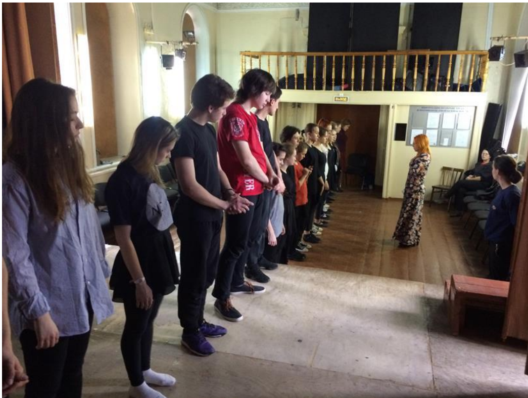
Plate 3. A 'training' on HIV in Kazan Theatre School (participants gave permission to be photographed).

A special area of activity of HIV activists is educational work with young people in vocational schools and universities (see Plate 3). Due to the virtual state ban on sex education in Russian schools, adolescents and young people demonstrate an extremely low level of competence not only with regard to HIV/AIDS, but also sexuality and health in general.