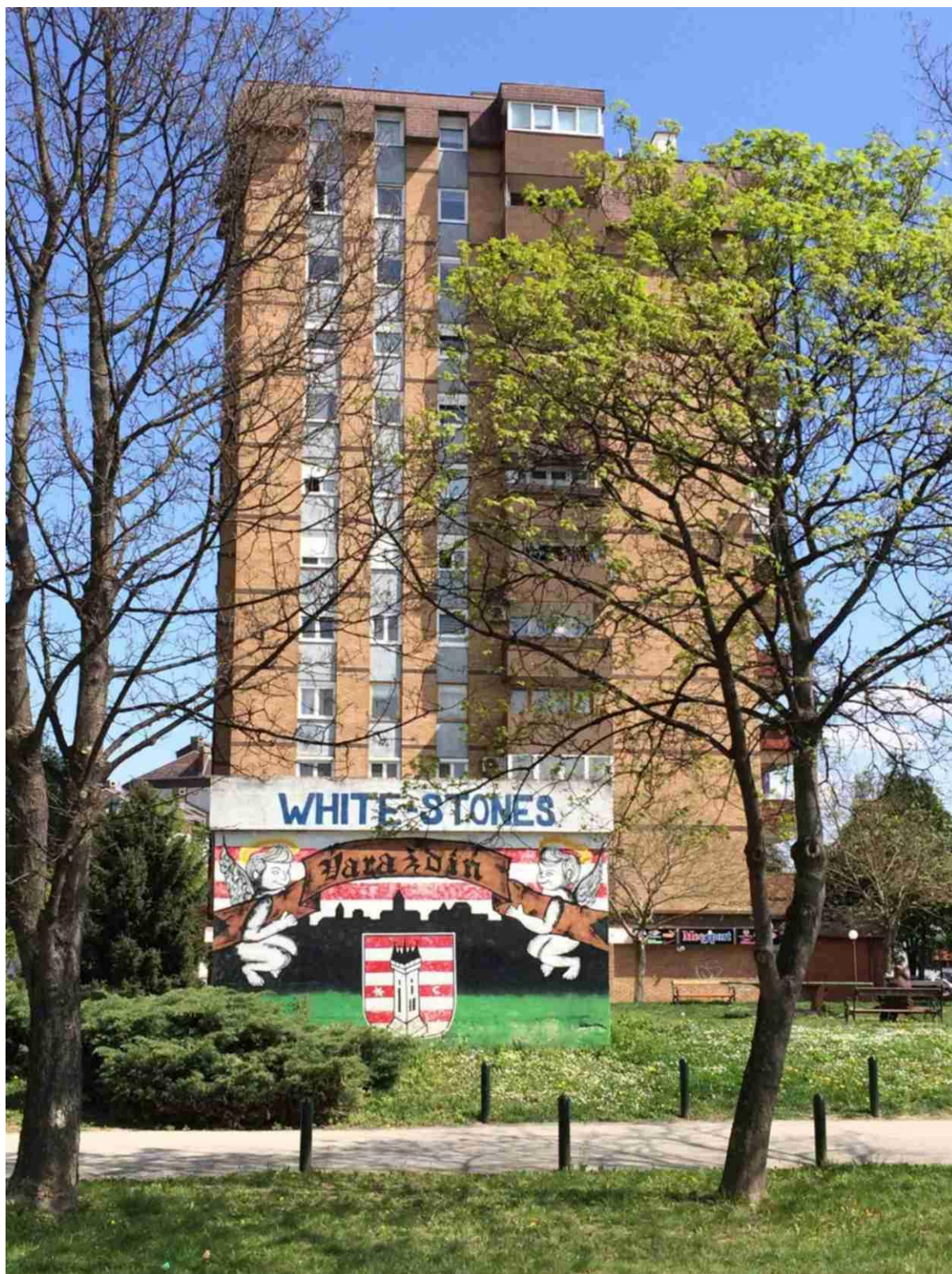
Plate 1. Graffiti in the Neighborhood